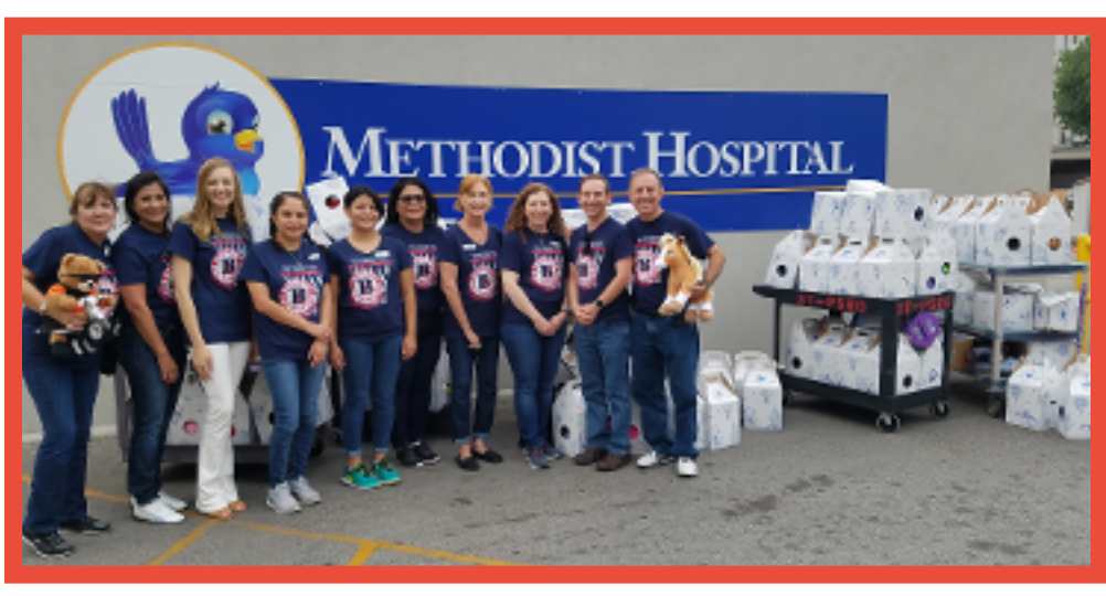
Volunteers preparing to deliver teddy bears

I am pleased to report that this year's Spring For A Teddy Bear of Love Project was an overwhelming success. You may recall from my article in the last District 15 Newsletter that I began this project in April of 2014 because I wanted to cheer up kids in the hospital. The need is something my wife and I experienced firsthand. When